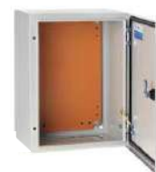
Single door Enclosure