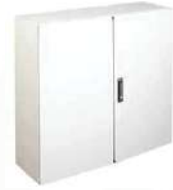
Double door Enclosure